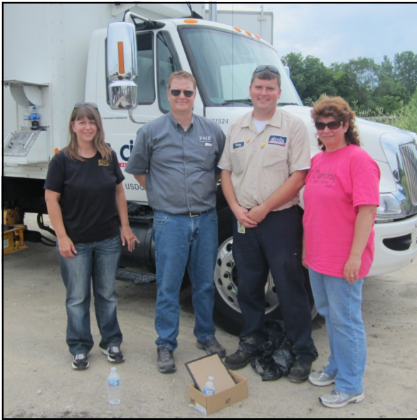
Farmers National Bank & Cintas

It took many hands to have everything run so smoothly at the 4th Annual Morrison Community Clean-up and Collection Day on Saturday, June 21, 2014. Thanks all around to the wonderful volunteers and collectors representing some great businesses and organizations within our community: Boy Scout Troup #96; First Presbyterian Church and Morrison Christian Reformed Church Volunteers for Self-Help; KAS Recycling; Morrison Auto Supply; Morrison Lions Club; Morrison Police Department; Roggy's Scrap Metal; and Schuler Motors. A special thanks to Farmers National Bank for their sponsorship. Everyone pitched in to help where they could, which made the event such a success. Donations collected will be used towards hazardous waste collection.