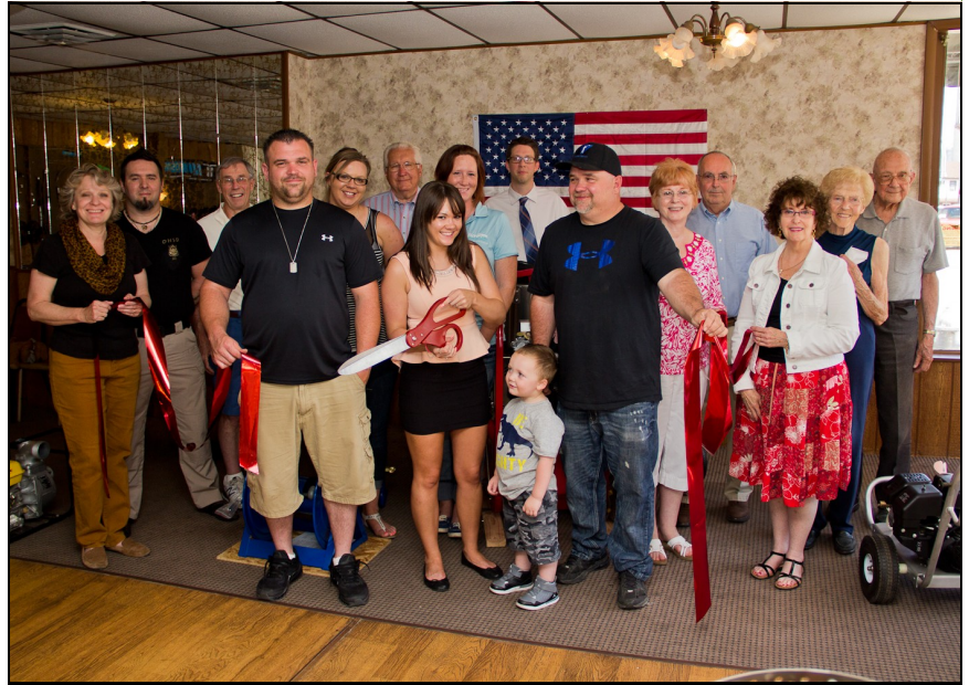
Pressure Washing Unlimited, Inc.