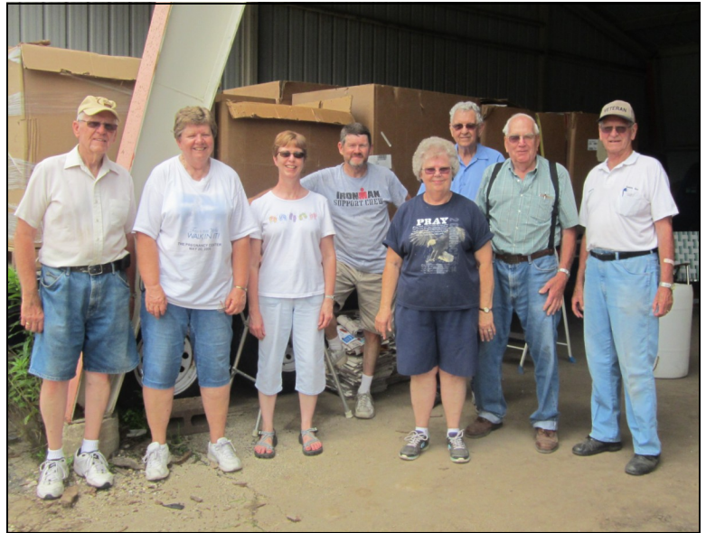
First Presbyterian Church and Morrison Christian Reformed Church Volunteers for Self-Help